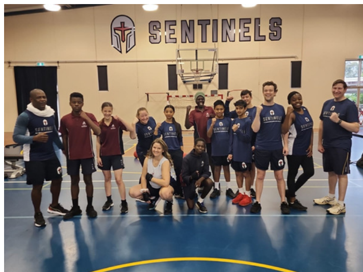
Look at their smiley faces!